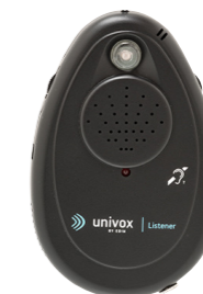
Univox® Listener Loop Receiver/Testing Device Part No 401010