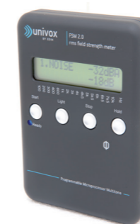
Univox® FSM 2.0 Field Strength Meter Part No 401040