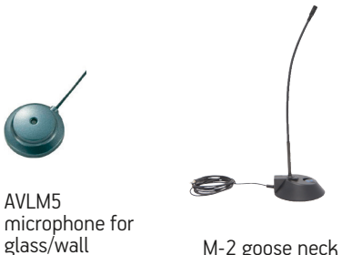
M-2 goose neck microphone