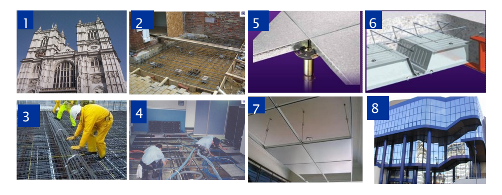
Table 1. Maximum loop width as a factor of construction metal for different heights

Depending on the construction and metal type, the maximum width of the loop must be reduced, The Table below gives a guide to the maximum loop width for different floor and ceiling constructions and listening heights