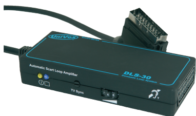
DLS-30 loop amplifier